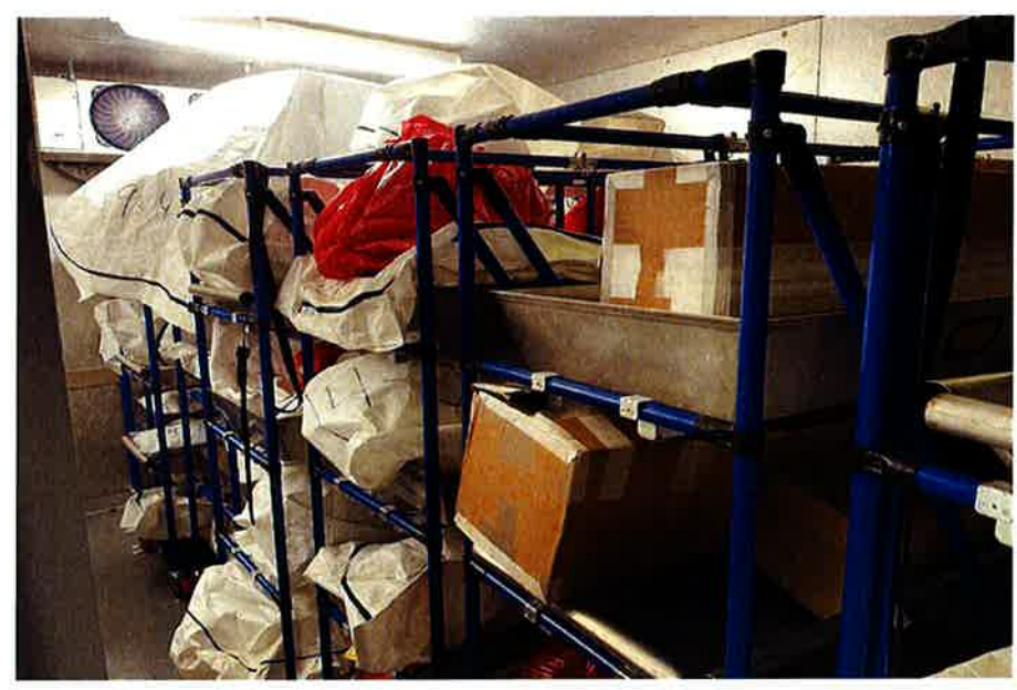
Figure 1 The Office of the Chief Medical Examiner's Freezer for Long-Term Storage of Decedents

The OCME is responsible for conducting medicolegal death investigations for certain deaths reported to chief medical examiner or his or her designee, a county medical examiner, or a county coroner, pursuant to §61-12-8 of W.Va. State Code. A medicolegal death investigation is initiated in order to investigate and certify the cause and manner of an unnatural or unexplained death. The OCME does not investigate all deaths that occur in the state; however, the cases it investigates include when any person in this state dies: