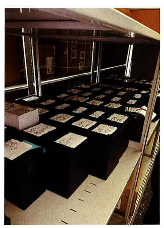
Figure 2 Cremated Remains of Unclaimed Decedents at the Office of the Chief Medical Examiner