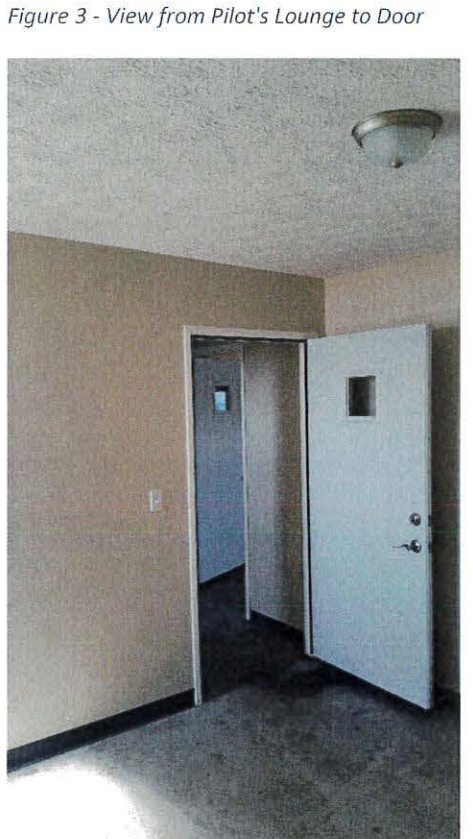
Evidence of Applicability of Coal Severance Reallocation Funds

Per WV Code §11-13A-6a, Coal Reallocation funds may be used for projects "... likely to foster economic growth and development in the area in which the project is developed for commercial, industrial, community