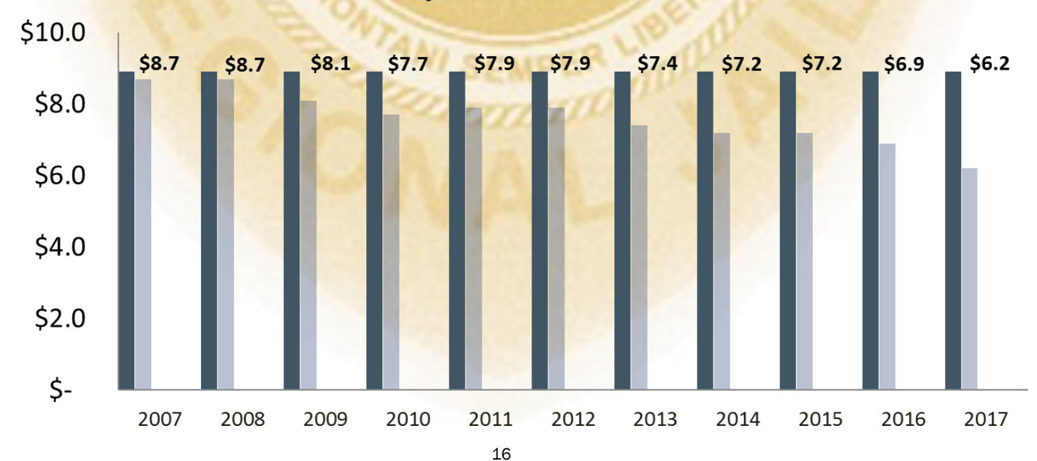
Debt Payment is $8.9 Each Year