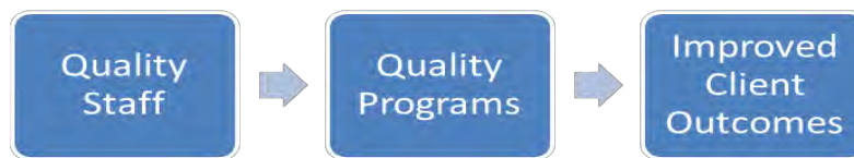
Figure 4. Quality Improvement Model

Therefore, it is critical that training specific to offender populations occurs and continues on an ongoing basis and that training efforts and service delivery are closely monitored for quality. As mentioned in the recommendation, in order to report on the effectiveness of the JRA and understand cost savings, it will be necessary to capture consistent measurements program-wide that include, but are not limited to: