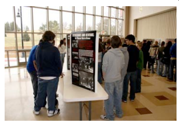
exhibit and important points to emphasize to prepare the students for their viewing of the panels. Other teachers have contacted the WVCHE directly for various forms of assistance in their teaching as a result of visiting the

High School alone. Pictured here is that group being introduced to the exhibit with a special presentation by an adult who volunteered and consulted the WVCHE to be assured that she was both knowledgeable about the content of the Holocaust