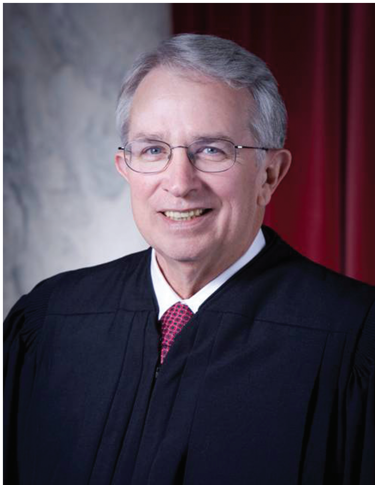
MENIS KETCHUM Chief Justice, Supreme Court of Appeals