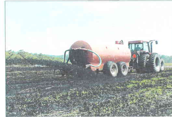
Liquid Filtrate Being Land Applied as a Soil Conditioner