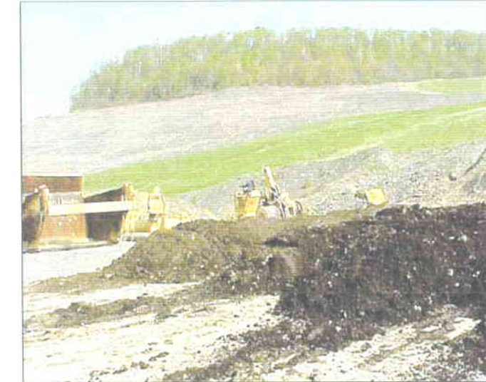
Filtrate used on Strip Mined Land as a Soil Enhancer to Aid in Revegetation