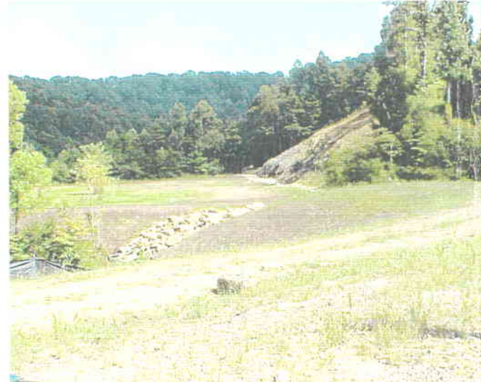
Filtrate used as Landfill Cap Material for Revegetation