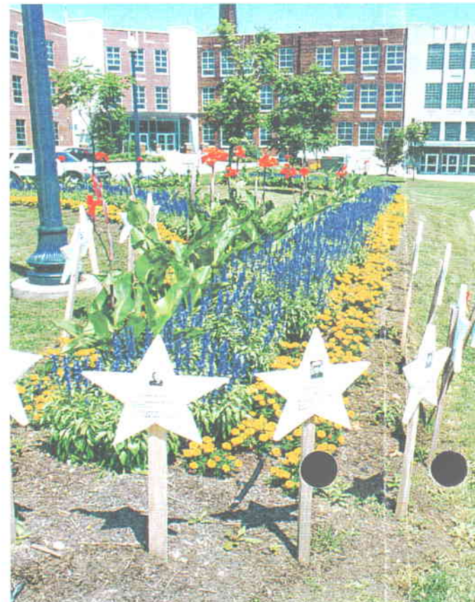
De-watered Filtrate used as a Soil Conditioner for Flower Gardens and on a Christmas Tree Farm