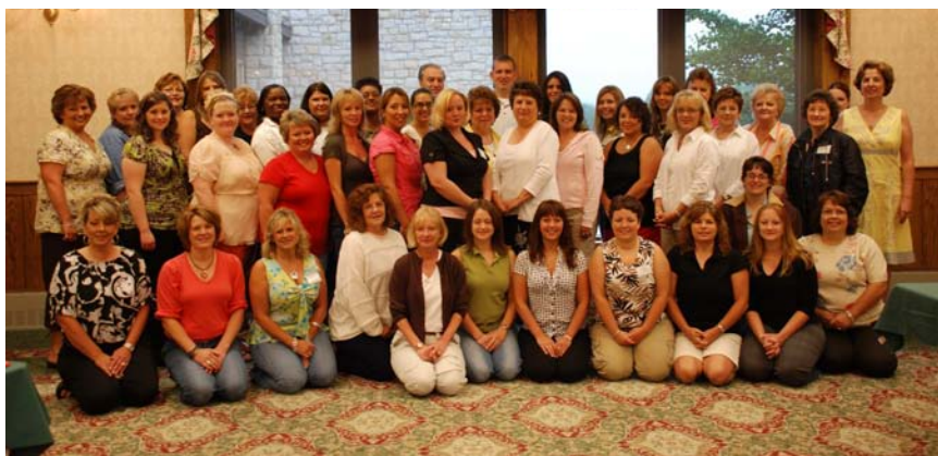
This photo was taken at the WV Prosecuting Attorney's Institute Summer Meeting