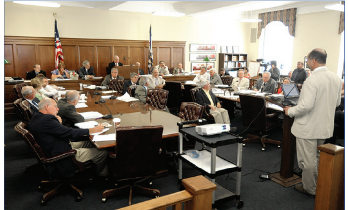
Judiciary Sub. B/ State Water Resources Committee (08/09/10)