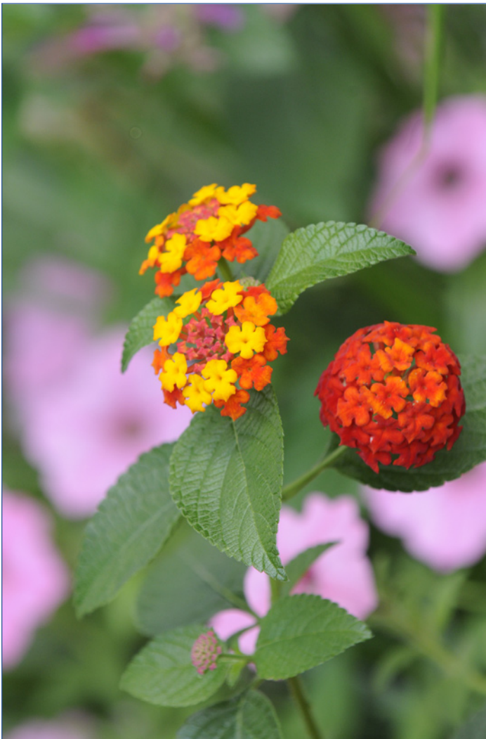
Capitol flowers continue to bloom through the summer months.