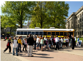
The Choice Bus was part of Operation Reach Out activities on April 19, 2010, at the State Capitol Complex.

During the month of April, a customized bus aimed at reducing dropout rates visited students in Wheeling, Lewisburg, and Charleston. The bus is half-school bus and half-prison cell and is designed to show young people the importance of completing their education. As participants enter the bus, they are seated and shown a four-minute movie which quizzes them on the earning