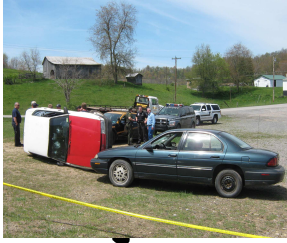
Mock car crash brings awareness to the dangers of drinking and driving