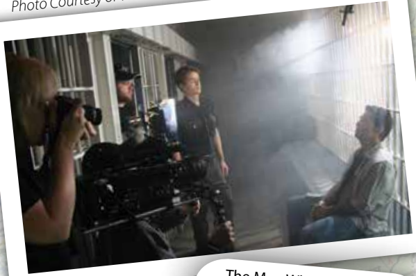
Hollow Creek Pineville-Wyoming County