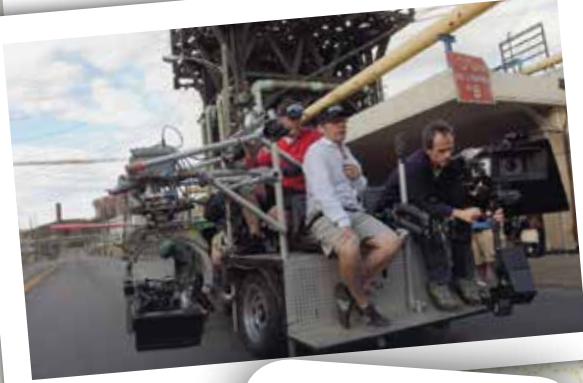
Super 8 Weirton-Hancock County