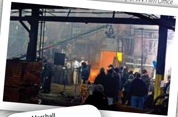
The Men Who Built America Wheeling-Ohio County