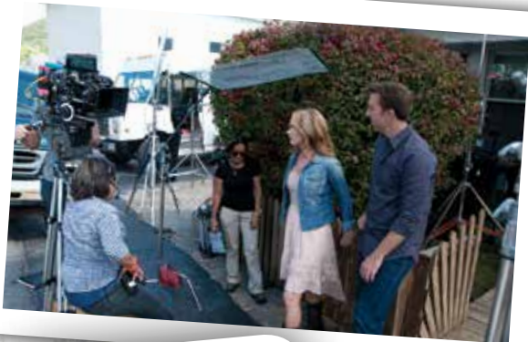
Angel's Perch Cass-Pocahontas County