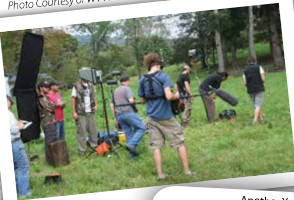
The Hunted Diane-Webster County