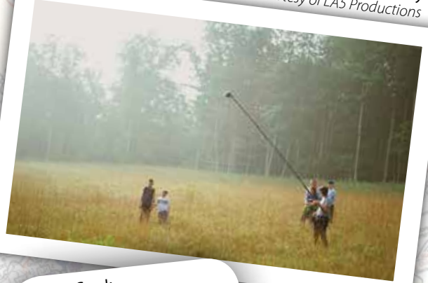
Little Accidents Daniels-Raleigh County