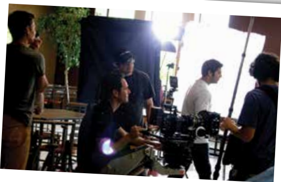
Another You Charleston-Kanawha County