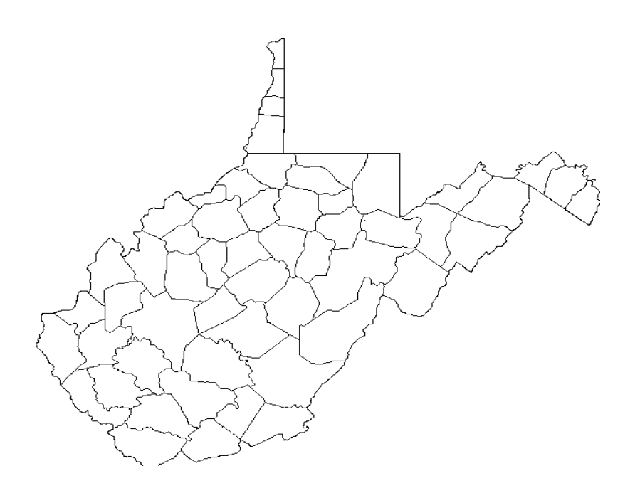
LICENSED DRIVERS BY COUNTY