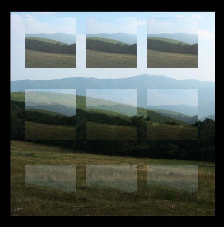
West Virginia Comprehensive Behavioral Health Commission