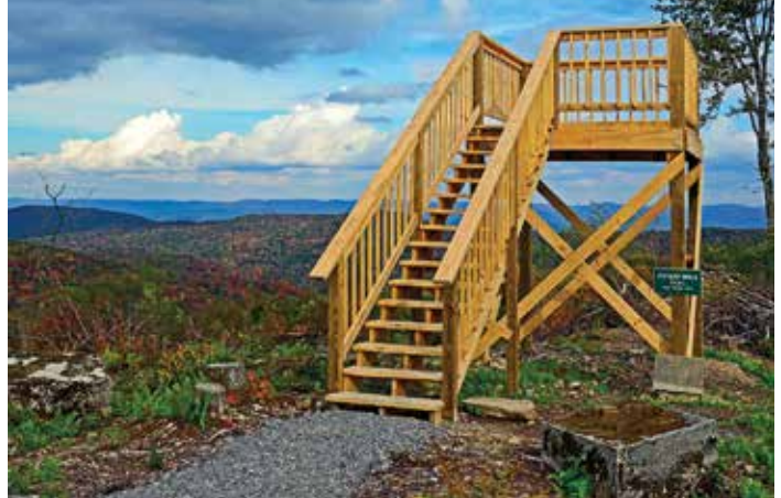
New overlook at Kumbrabow State Forest.