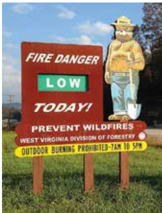
Roadside wildfire danger sign.

Numerous Smokey Bear Wildfire Danger signs are in place throughout W.Va. to serve as a reminder to be careful with fire. These signs warn citizens of the potential risk of a wildfire occurring due to dry weather conditions.