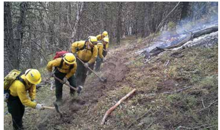
W.Va. Foresters work a fire line in Montana.

Part of the WVDOF Suppression program also involves providing wildfire suppression and disaster assistance to other in-state agencies and to other states and federal agencies. In FY 2013, the WVDOF sent a 20-person fire crew to South Dakota, Arizona and Montana to assist with wildfire suppression. Wildfire investigators were sent to Idaho and North Dakota to assist with wildfire cause determinations and investigations. WVDOF personnel provided disaster assistance in-state clearing trees from roads and delivering emergency supplies following the snowstorm