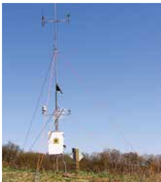
WVDOF weather station.

Fire foresters in the WVDOF's Fire Protection group continually make preparations to safely and effectively suppress a wildfire