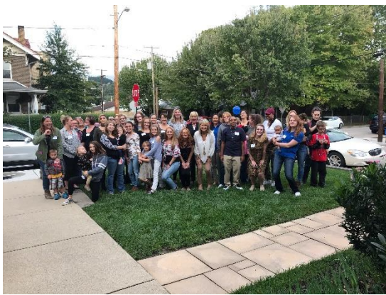
Figure 1 Rea of Hope (Recovery, Housing, Employment) – over 200 graduates

The Neighborhood Investment Program has proven in its 27 years of existence to be a significant force when it comes to encouraging businesses and individuals to contribute to their local non-profit organizations. The NIP encourages community development by providing the incentive many businesses and individuals need to get involved in their local organizations which are primarily providing services for emergency assistance, direct needs, and many other services to low-income individuals in distressed neighborhoods. By working to build these relationships, the NIP helps to increase the capacity of our communities to support projects which serve our most economically distressed citizens and neighborhoods.