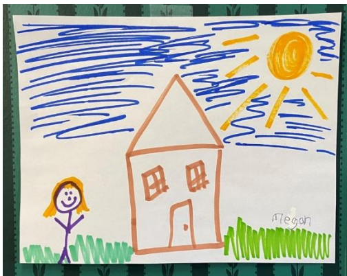
Figure 4 United Way of Greenbrier Valley - A small girls drawing because she was so ecstatic over her home being rebuilt after a flood.