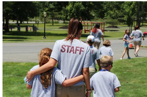
Figure 3 Hospice of Southern WV – children learning to deal with grief at camp