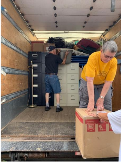
Appalachian Outreach making a delivery to Family Resource

The NIP was reauthorized during the 2021 Legislative session for an additional five years through the passage of S.B.293. Funding levels for the program remained unchanged at $3 million annually. The program remains at $3,000,000 and will run through June 30, 2026.