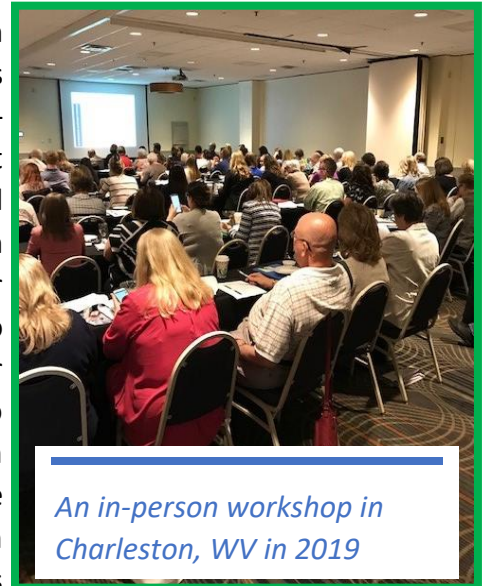
An in-person workshop in Charleston, WV in 2019

Increasing the awareness and understanding of the NIP continued to be a priority in 2023, along with a focus on increasing usage rates by participant organizations. NIP staff was unable to host the two workshops in 2020-2023, due to COVID-19 restrictions which educates applicants and participants about the program. The workshop presentation was posted and available for all participants to review on the webpage and then they were to complete a questionnaire and attach it to their application. The workshops were designed to provide guidance to organizations regarding the rules of the program and to better prepare organizations regarding the rules of the program and to better prepare organizations for writing their NIP application. In addition to the presentation, NIP staff was available prior to the due date of the application, to provide assistance. NIP staff, in conjunction with the West Virginia Department of Commerce's Communications Department, marketed the workshops statewide to facilitate public awareness.