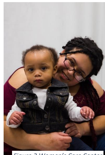
Figure 2 Women's Care Center