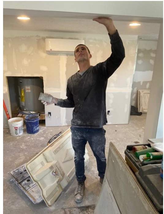
Brian's Safehouse – training a scholarship recipient while working on a transition house.