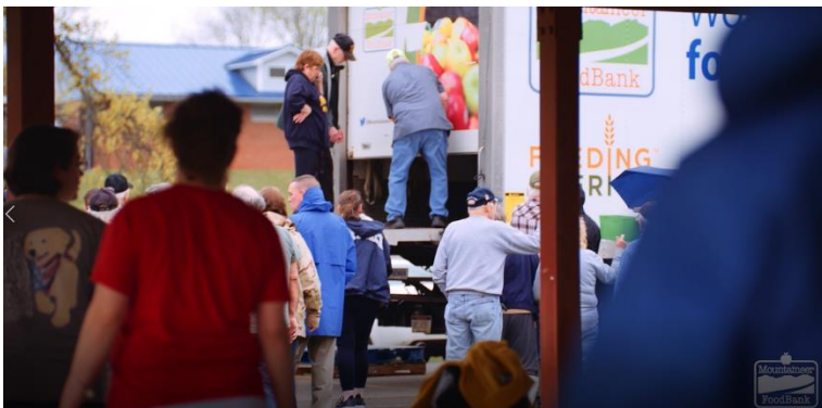
Figure 4 Help for our Veterans