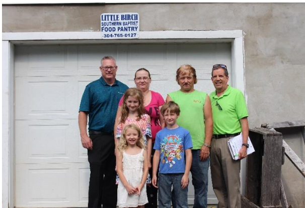
Figure 2 Outreach Family who received clothing, food & supportive services

The Neighborhood Investment Program has proven in its 26 years of existence to be a significant force when it comes to encouraging businesses and individuals to contribute to their local non-profit organizations. The NIP encourages community development by providing the incentive many businesses and individuals need to get involved in their local organizations which are primarily providing services for emergency assistance, direct needs, and many other services to low-income individuals in distressed neighborhoods. By working to build these relationships, the NIP helps to increase the capacity of our communities to support projects which serve our most economically distressed citizens and neighborhoods.