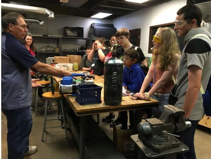
Pathways to Success – The House of the Carpenter Belmont Tech College

The NIP was reauthorized during the 2021 Legislative session for an additional five years through the passage of S.B.293. Funding levels for the program remained unchanged at $3 million annually. The program remains at $3,000,000 and will run through June 30, 2026.