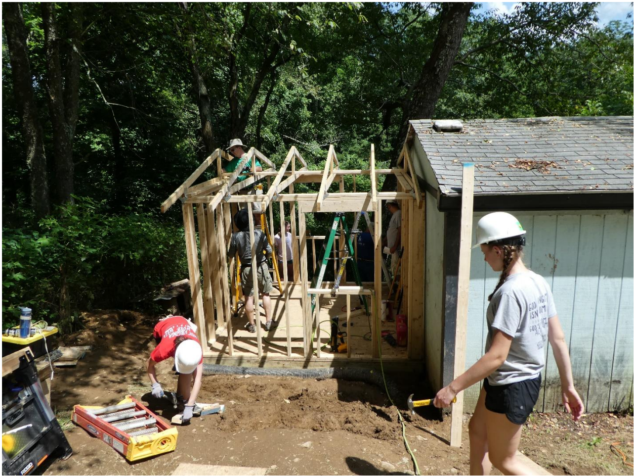
Learning a Trade