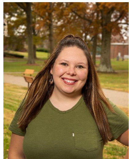
Figure 1 WVU State graduate with NIP Scholarship