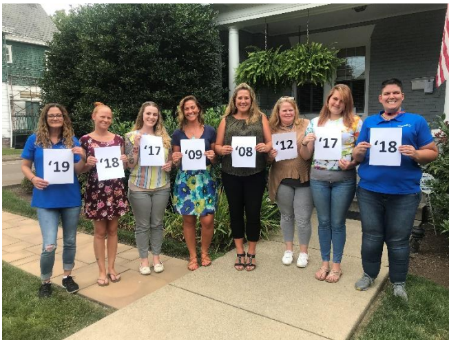
Rea of Hope graduates from a program teaching women to be self-sufficient in Kanawha County