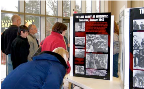
Exhibit in Clarksburg