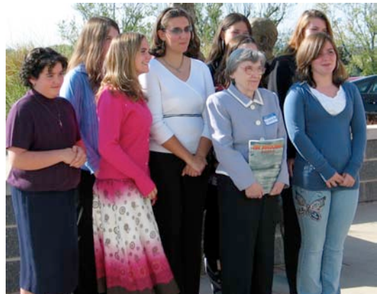
Awards presented in Morgantown