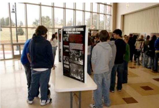
exhibit and important points to emphasize to prepare the students for their viewing of the panels. Other teachers have contacted the WVCHE directly for various forms of assistance in their teaching as a result of visiting the