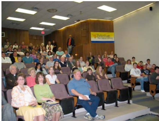
Presentation in Parkersburg