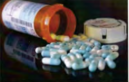
WEST VIRGINIA REMAINS #1 IN PRESCRIPTION DRUG-RELATED OVERDOSE DEATHS

Pain that has persisted after reasonable medical efforts have been made to relieve the pain or cure its cause and that has continued, either continuously or episodically, for longer than three [3] continuous months. For purposes of this article, "chronic pain" does not include pain directly associated with a terminal condition.