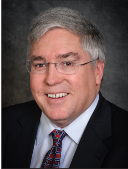
PATRICK MORRISEY Attorney General of West Virginia

Patrick Morrisey was elected as the Attorney General of West Virginia on November 6, 2012, and sworn into office on January 14, 2013. Patrick Morrisey is the first Republican to serve as Attorney General in West Virginia since 1933 and, as a resident of Harpers Ferry, Morrisey is the first Attorney General from Jefferson County.