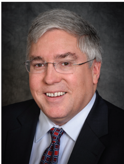
PATRICK MORRISEY Attorney General of West Virginia

Patrick Morrisey was elected as the Attorney General of West Virginia on November 6, 2012, and sworn into office on January 14, 2013. Patrick Morrisey is the first Republican to serve as Attorney General in West Virginia since 1933 and, as a resident of Harpers Ferry, Morrisey is the first Attorney General from Jefferson County.