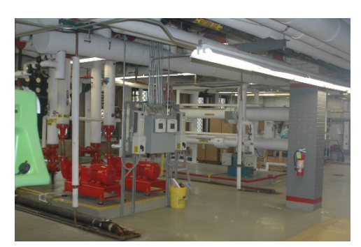
Figure 5 - Energy Saving Project on Floor 11 of Building 5

(8) of these 18 properties were acquired through state or local bond issues. The three most recent purchases, Logan, New Clarksburg and New Fairmont buildings, are new constructions using cash. However, the DOA indicated to PERD that it may issue bonds for the Clarksburg and Fairmont buildings. Energy Saving Project listed in Table 3 involved the purchase of a central high-pressure steam