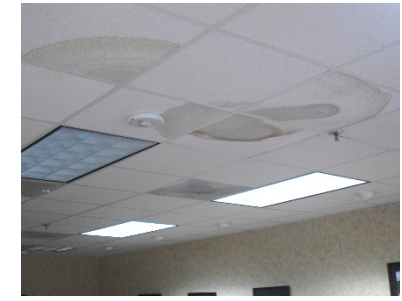
Figure 6 - Areas of leaks on top floor of Building 86

of repairs or renovations at the time of purchase (see Table 11). Renovation costs to make the facilities suitable for office space and make them compliant with federal and state law can be considerable, and it may be years before those costs are recouped in rent payments. The Greenbrooke building (Building 86), located in Charleston, was constructed in the 1920s. The DOA issued revenue bonds for the building in 2009 with a principal and interest amount