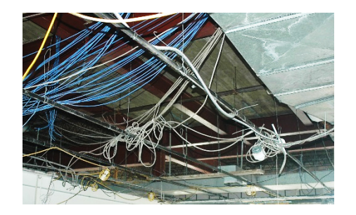
Figure 2 - Floor 6 of Building 4

According to the GSD, Building 4 is in the second worst condition on the Capitol Complex. building The has asbestos throughout the structure, the HVAC system is functionally obsolete, and the restrooms do not comply with American Disability Act (ADA) standards. Floor 3 of Building 4 is completely unoccupied and is