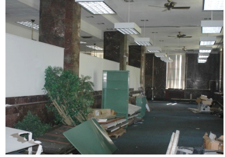
Figure 1 - First Floor of Building 3

building is in the worst condition of the Capitol Complex buildings, and it remains uninhabitable to date. Figure 1 at the right shows the first floor of Building 3. Plans to renovate Building 3 have been in place as early as 2000. The building had asbestos abatement completed in fiscal year (FY) 2013. The first attempt to renovate Building 3 was in FY 2011. However, bids for the project came in at $35 million,